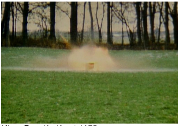
Kiste (Box 40x40cm), 1975