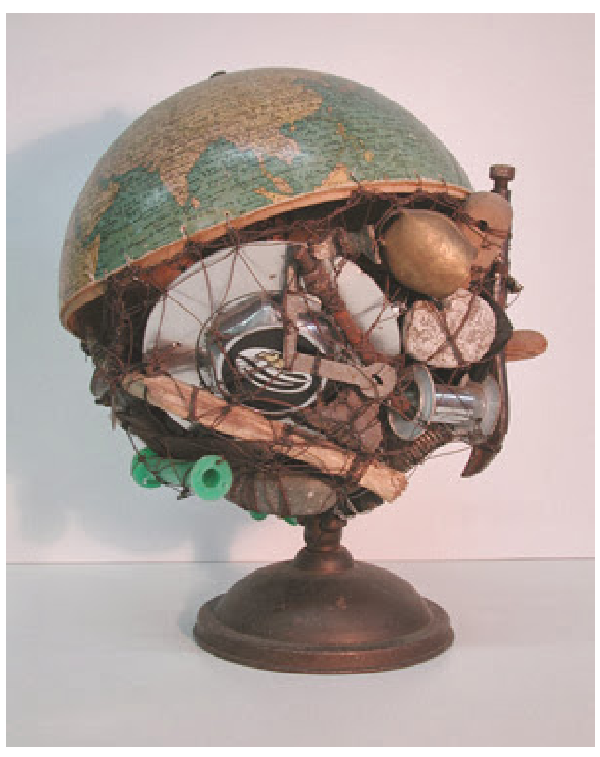
Arthur Simms, "Globe, The Veld" (2004). Metal, Wire, Plastic, Artist's Nails, Wood, Objects, 17" by 14"by 14"

Consider him at work and excited by this project. His first practical step is retrospective. He has to turn back to an already existent set made up of tools and materials, to consider or reconsider what it contains and, finally and above all, to engage in a sort of dialogue with it and, before choosing between them, to index the possible answers which the whole set can offer his problem. He interrogates all the different objects of which his treasury* is composed to discover what each of them could 'signify' and so contribute to the definition of a set which has yet to materialize but which will ultimately differ from the instrumental set only in the internal disposition of its parts. A particular cube of oak could be a wedge to make up for the inadequate length of a plank of pine, or it could be a pedestal – which would allow the grain and polish of the old wood to show to advantage.[5]