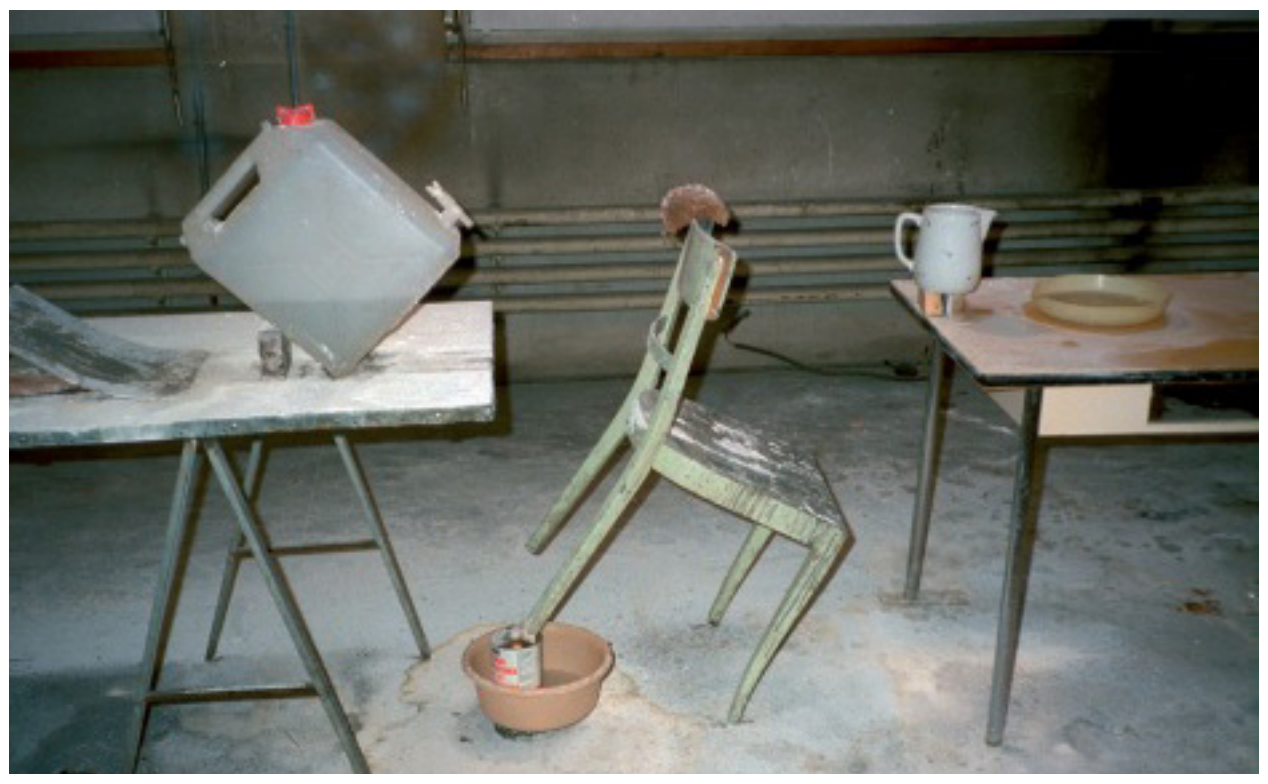
Der Lauf Der Dinge (The Way Things Go), 1987

First there were the 'Equilibriums'. We were sitting in a bar somewhere and playing around with the things on the table, and we thought to ourselves, this energy of never-ending collapse - because our construction stood for a moment and then collapsed before we built it up again - should be harnessed and channelled in a particular direction.