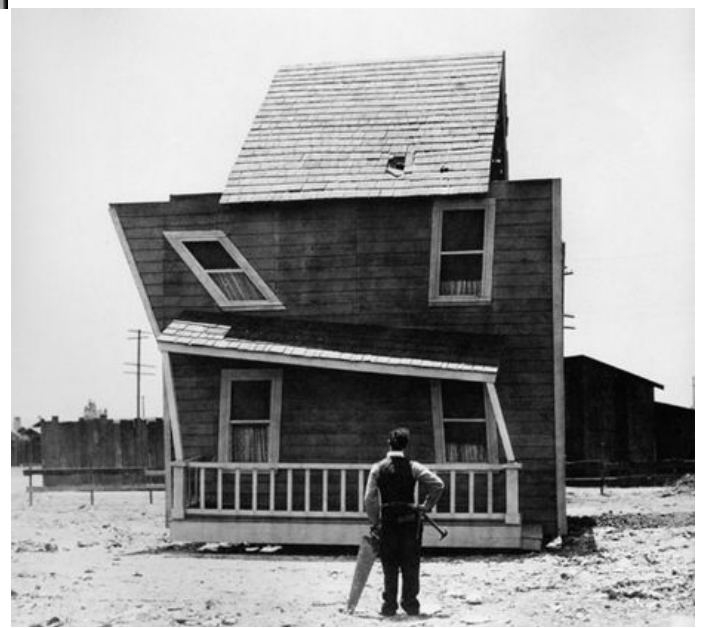
One week, 1920

His first feature, Three Ages (1923) was produced similarly to his shorts and was the start of a new era in comedic cinema, where it became apparent to Keaton that he had to put more focus on the storylines and characterization. the last two he regarded as his best films.