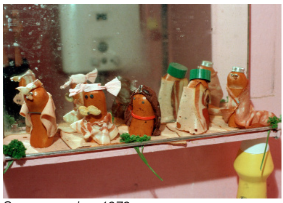
Sausage series, 1979

1964-1965 Studied at the Kunstgewerbeschule, Basel, Switzerland