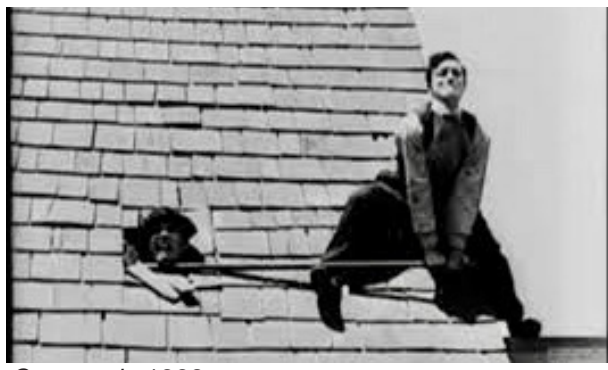
One week, 1920

Keaton's independent shorts soon became too limiting for the growing star. After a string of favorite films like One Week (1920), The Boat (1921) and The Cops (1922), Keaton made the transition into the feature film.