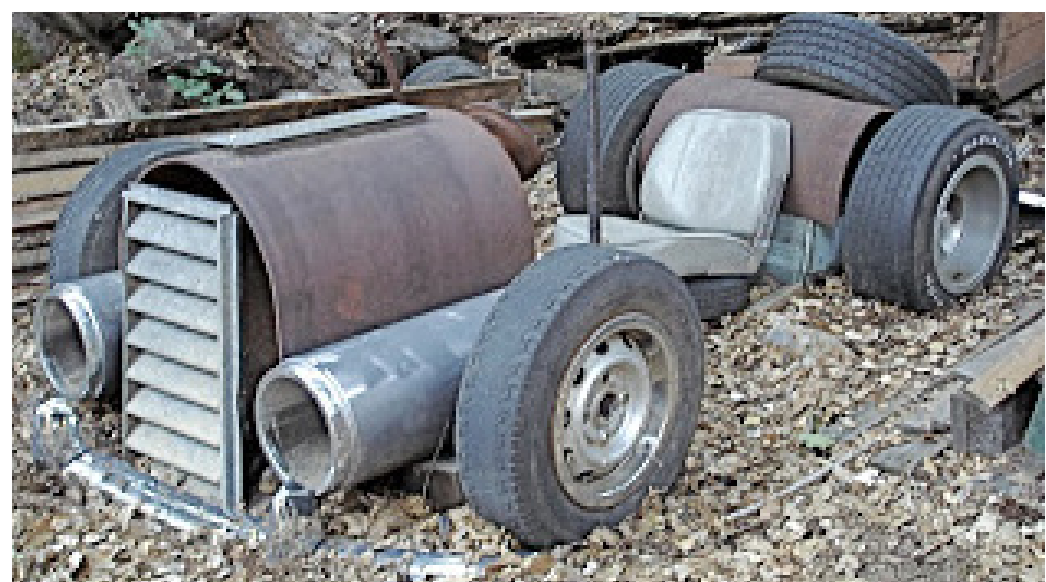
Don't need no Chevy, no Ford, no Dodge. Got my own hot Bricolage

The analogy is worth pursuing since it helps us to see the real relations between the two types of scientific knowledge we have distinguished. The 'bricoleur' is adept at performing a large number of diverse tasks; but, unlike the engineer, he does not subordinate each of them to the availability of raw materials and tools conceived and procured for the purpose of the project: his universe of instruments is closed and the rules of his game are always to make do with 'whatever is at hand', that is to say with a set of tools and materials which is always finite and is also heterogeneous because what it contains bears no relation to the current project, or indeed to any particular project, but is the contingent result of all the occasions there have been to renew or enrich the stock or to maintain it with the remains of previous constructions or destructions. [2]