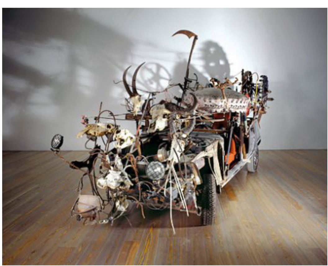
Le Safari de la Mort Moscovite, 1989, Jean Tinguely Material / technique: Renault Safari, scrap iron, skulls, fabric, scythe, lamps, electric motor.

It can also be difficult to distinguish between your own ideas and what you discover, when investigating using the easy information available today at, for example, YouTube. These opportunities for information or impressions Tinguely didn't have. Conversely, you were not influenced by the creativity of others when searching for information.