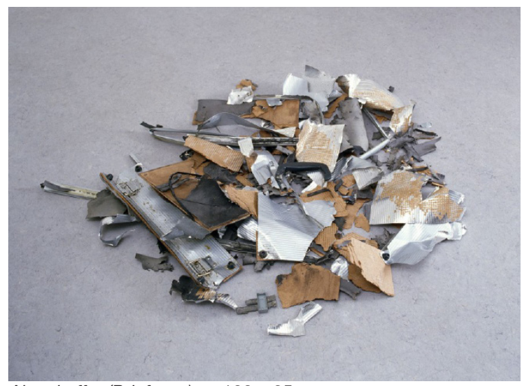
Aktenkoffer (Briefcase) ca 100 x 85 cm Galerie Martin Janda, 2001

A concrete-filled briefcase is at a particular moment dropped by the artist from a helicopter at a height of about a hundred meters and crashes into a grassy field, making a deep crater; then the case was photo documented. The work could give an association to when a meteorite crashes to the ground. Simply done!