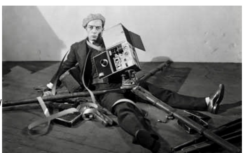
The Cameraman, 1928

His first appearance in a film with sound was with ensemble piece The Hollywood Revue of 1929, though, despite the popularity of it and his previous MGM silents, MGM never allowed Keaton his production unit, and increasingly reduced his creative control over his films.