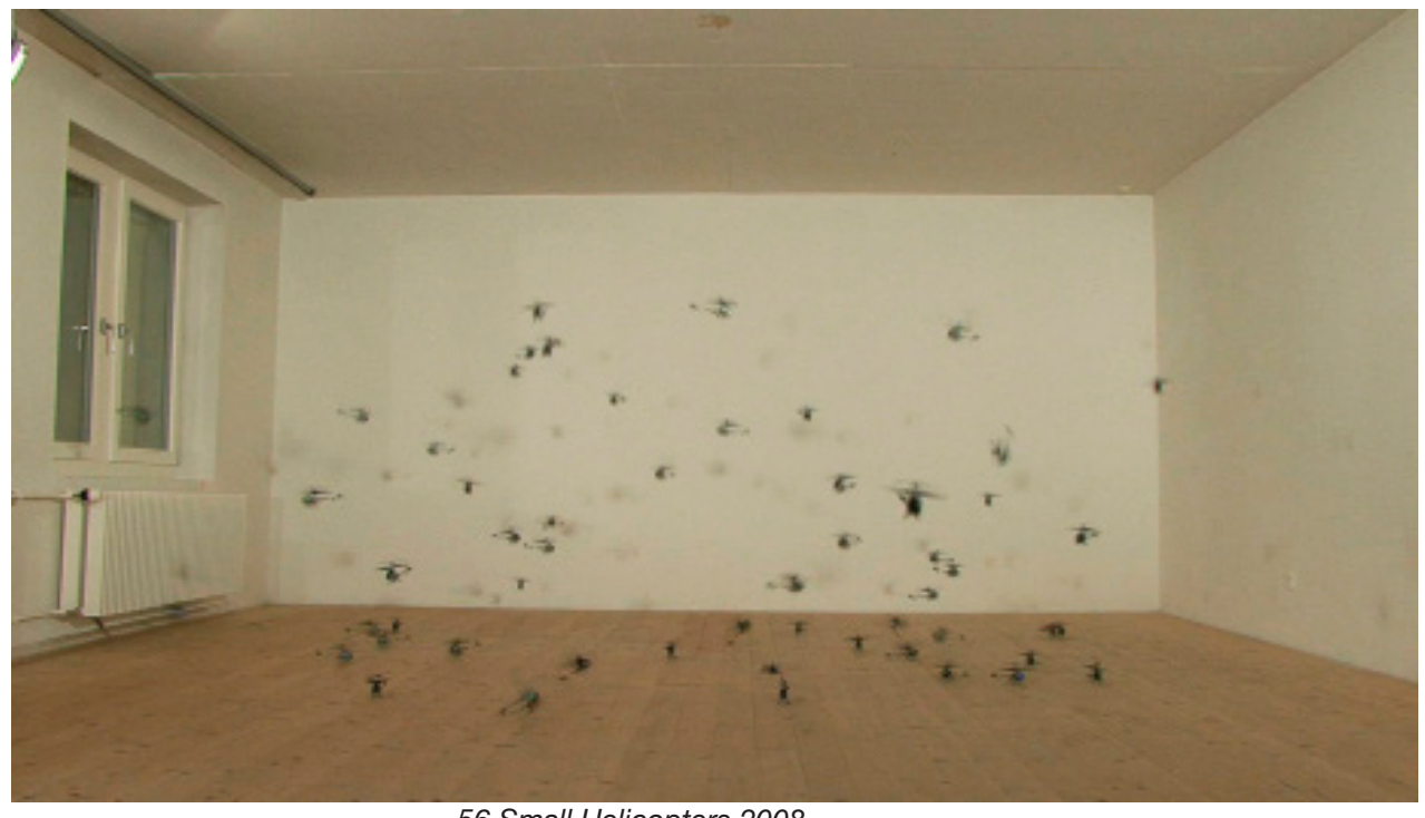
56 Small Helicopters 2008

Signer's 'accident sculptures' use experiments to test things out, with the proceedings documented as evidence. In 56 Small Helicopters (2008) he sets off a swarm of insect-like model helicopters in a room far too small for their movement to be unimpeded. One by one they collide, and fail in a joyful choreography of not working.