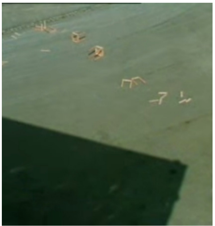
Kurhaus Action (1992)