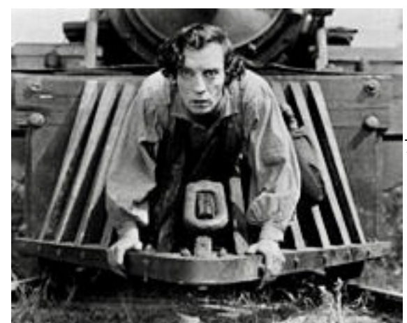
The General, 1926