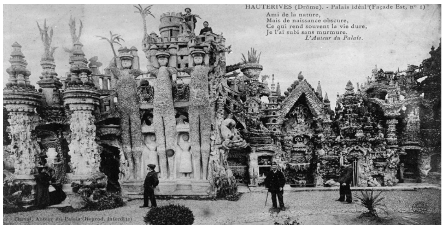
The Villa of Cheval the Postman, 1912

My foot had stumbled against a stone which almost made me fall: I wanted to know what it was. It was a stumbling block of such an unusual shape that I put in my pocket to admire it at my leisure. Ferdinand Cheval