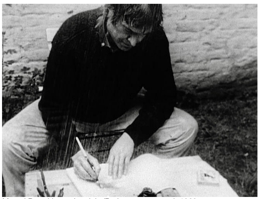
Marcel Broodthaers La pluie (Projet pour un texte), 1969

When I started working on my thesis, I decided that the topic should be something that relates to my work processes. In a book 'Dictionary of Critical Theory' I found the word 'bricolage' which was interesting because the related French for tinkering about or do-it-yourself, a bricoleur, is committed to the odd job and is a jack-of-all-trades, as distinct from a craftsman. This sentence is what I can use from the description in Claude Levi-Strauss's book, The Savage Mind , 1962. It's hard for me to write, and it feels like a model of Sisyphean failure and repetition and waste of energy or time, as in Marcel Broodthaers movie La Pluie where he sits in the pouring rain and tries to write but has to start over again and again.