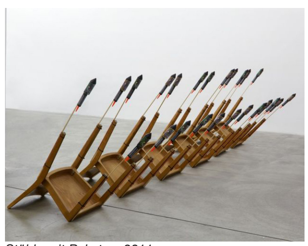
Stühle mit Raketen, 2011

"This characterizes temporal discontinuity in tragic terms. But definitive change can also be a benefit, and the awareness of transience can increase the preciousness of an experience. (Freud made an economic comparison: "transience value is scarcity value in time.") Maybe Bachelard's theory more vividly articulates the delicious, unrepeatable surprises that many of Signer's experiments issue in. One's first viewing, on film, of the shutters of the Kurhaus Weissbad, simultaneously propelled open by live fireworks (Aktion Kurhaus/Kurhaus Action, 1992) triggers an unrevisitable thrill of pure delight. So does Tisch mit Hut (Table and Hat, 2005). A hat sits on a table; suspended from the gallery ceiling, a garden leaf-blower is aimed at the hat. Visitors are invited to activate the blower. The consequence is absurd, stupidly obvious: the jet of air will cause the hat to fly off the table. And of course that's what happens - but the experience of the event is sharp, utterly 'other' to the anticipation. Activated, the work induces a momentary, unique blend of hilarity and shock. "Before intuition, there is the surprise ... We need the concept of the instantaneous to understand the psychology of beginning", Bachelard argued. "Embracing the possibility of radical, absolute newness means accepting the extinction of the old." [13]