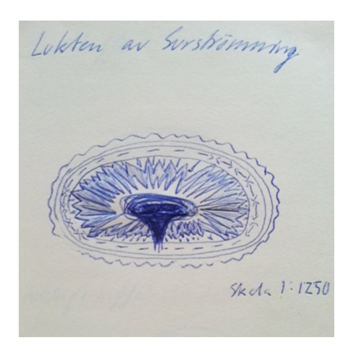
Drawing of how fermented herring smells, scale 1:1250