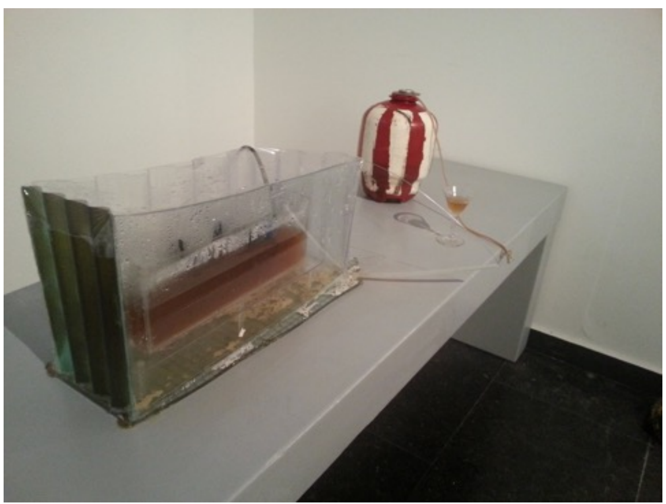
Boskoffie, 2015 Glass, various plastics, aquarium heater, poplar buds, water, sugar and yeast

Expectation demands precision in time, and it demands that not all happens right away, that there is a time line. The image below shows a distillery I made for and from a certain park in Amsterdam. This corpus object condenses the area through extracting flavours, smells and boozy potency, celebrating what we can do out of the status quo; mining some of that location's uncountable essences.